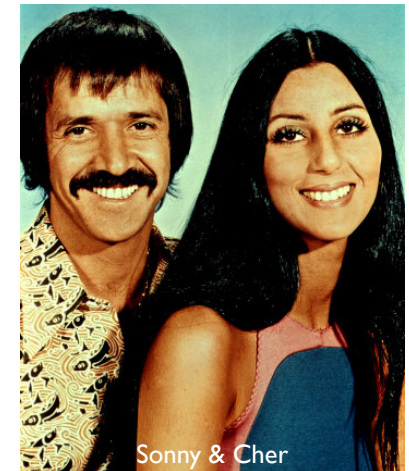
Sonny & Cher